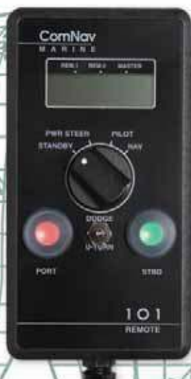
101 Remote Control