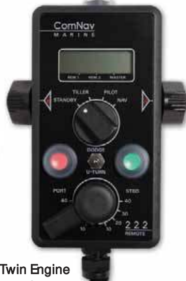
222 Twin Engine Remote Control