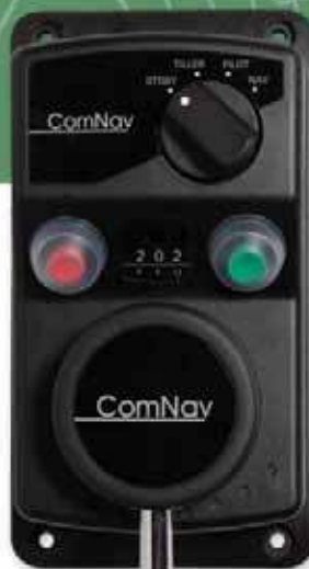
TS-202 FFU Lever Remote Control (Fixed Mount)