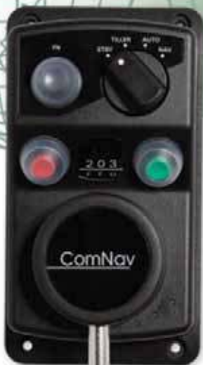
TS-203 FFU Lever Remote Control (Fixed Mount)