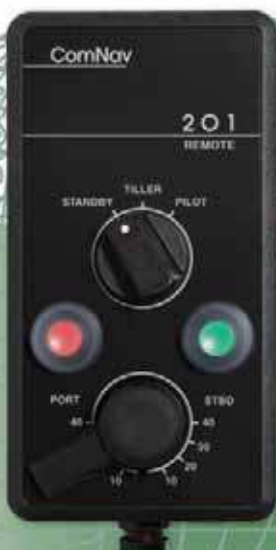
201 Remote Control