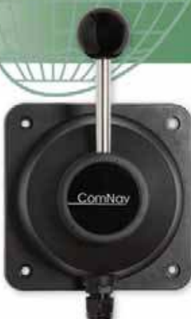
NFU Jog Switch