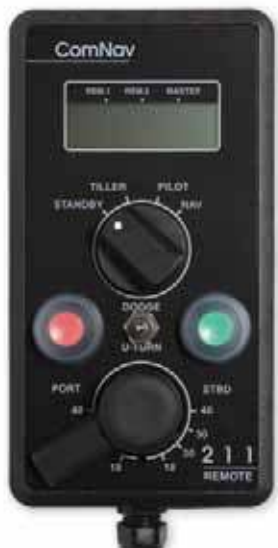
211 Remote Control