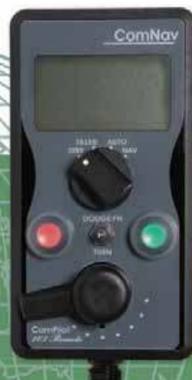
203 Remote Control