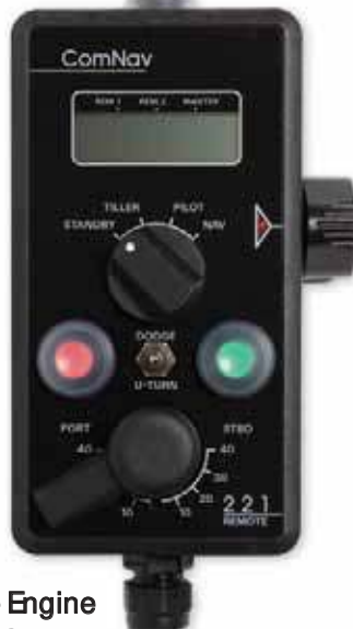
221 Single Engine Remote Control